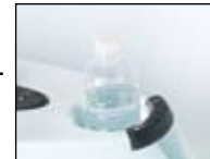
Integrated Water Bottle Holder