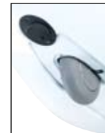
Optional Integral Wheel no need for a trolley!