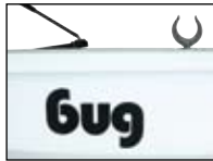
Oars and Oarlocks store within the hull