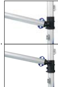
Two Position Gooseneck makes switch between the standard and Race rig a snap