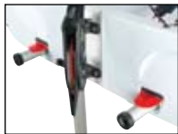
Optional Integral Carry Handles when purchased with wheel option