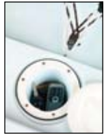
Secure Storage Port