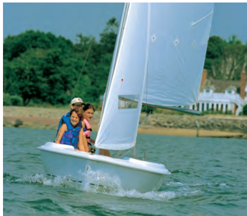
Versatile for the sailing family

Aft Mast Carrier Mainsail Cover Mast Float Motor Mount 2.5 HP Outboard Motor Seat Cushions Trailer - Galvanized Trailer Tongue Jack