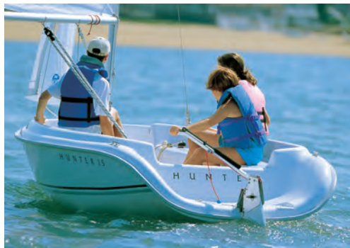
Wide beam for safety and stability