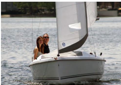
Wide beam for safety and stability