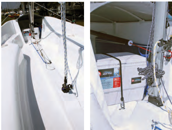
Roomy, Comfortable Cockpit with Standard Cuddy Cooler