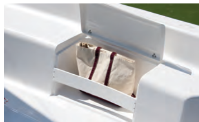
Convenient Cockpit Seat Storage