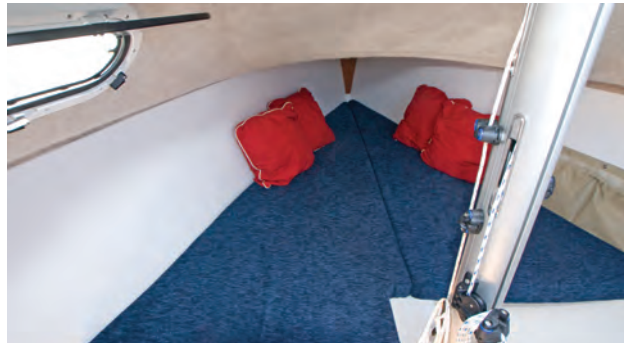
Roomy, Comfortable Cuddy Cabin