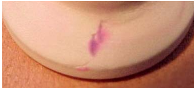
EXPOSED CRACK USING DIE PENETRATE TEST

For visual inspection, the rod or fittings must be cleaned or polished to expose the cracks. Rusty areas frequently indicate cracks underneath. In addition to cracks, you should look for corrosion, pitting, black streaks, rust and visible wear. Any areas showing discoloration or potential corrosion should be thoroughly cleaned and inspected. If any evidence of pitting, corrosion or wear remains after this cleaning, please consult an authorized Navtec service agent. Pitting, corrosion or visible wear could require re-heading, replacement of the rod or replacement of associated fittings.