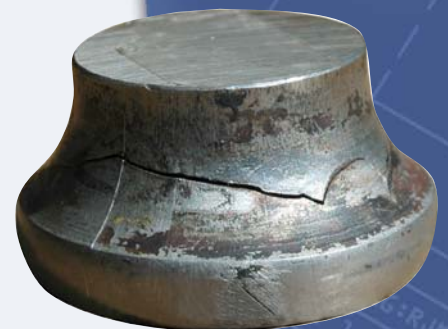
Transverse crack in Rod Head

Cracks in rigging components, especially cracks that are orientated transverse to the load, are a sign of impending failure. Cracks can be found using visual inspection, a magnifier, or by dye penetrate testing. Navtec recommends these techniques, but other professional testing techniques available are X-ray testing, eddy current testing and ultrasonic testing, which allows you to inspect rod heads for transverse cracks in closed fittings.